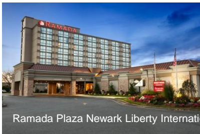
Ramada Plaza Newark Liberty International Airport

※ 套票以淡季價格計算。於旺季、假期前夕或大型節日期間出發。需另付附加費。詳情向本社職員查詢作準。