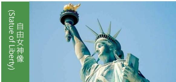
自由女神像 (Statue of Liberty)

Admissions : Liberty Cruise, D.C. Harbor Cruise & Niagara Falls Movie (due to the US Federal Government regulation on driving hours and sunset time, night view should be limited and not guarantee)