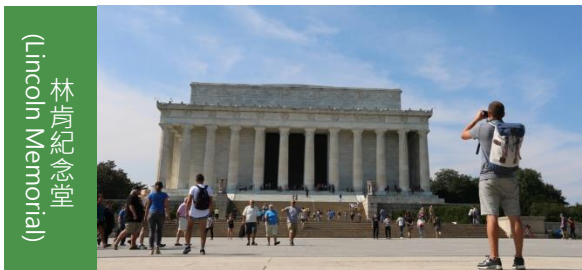
林肯紀念堂 (Lincoln Memorial)